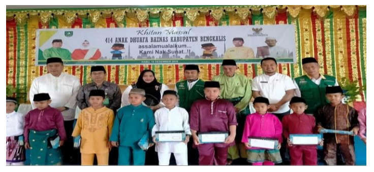
Figure 5. Mass circumcision of underprivileged children by the Bengkalis Regency Baznas