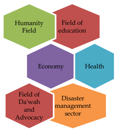
Figure 2. Analysis of the Bengkalis Regency BAZNAS program

From the author's research BAZNAS, Bengkalis Regency has six programs that have become the main priority. This program also adopts the main agenda of the Central Baznas because the purpose is a clear picture for the benefit of the ummah, such as empowering the mustahik economy by providing productive zakat assistance for business. These programs include: