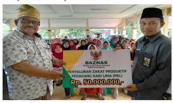
Figure 3. Distribution of productive zakat for street vendors by Baznas of Bengkalis

In this case, BAZNAS itself provides full support to people who have businesses, both individuals and groups and street vendors. In this case, examples of companies include assistance with tempe machines, service with sewing tools, and aid to anglers to help finance the need to buy nets and other businesses. Baznas themselves play an important role in the economic progress of the community. In this field, Baznas issues assistance such as cash and goods. The process is Mustahik. Making a business proposal is submitted to Baznas. Baznas does a field survey to see if the condition is feasible or not, the Mustahik accepts, and a meeting is held again. Bengkalis Regency Baznas also monitors the businesses provided by Baznas every three months.