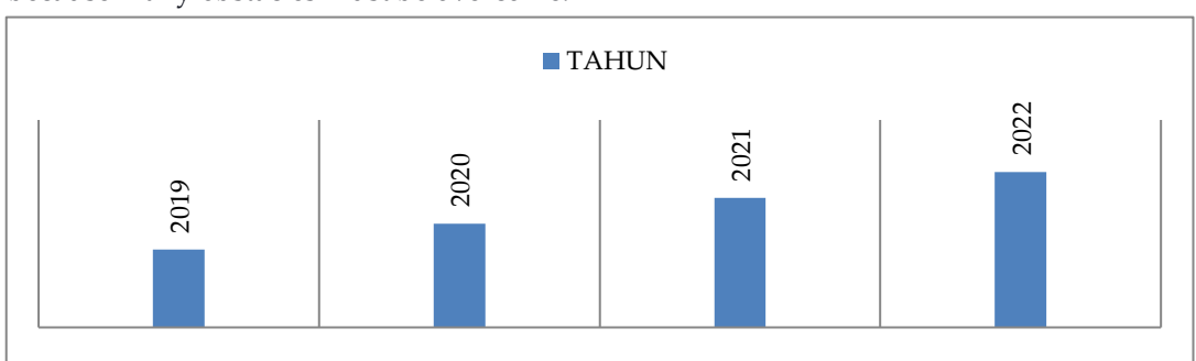
Figure 11. percentage of poor people in Bengkalis district

Previously, BAZNAS conducted a direct survey of mustahik candidates and decided together with the chairman and management of BAZNAS. The impact of productive zakat management on the poor who run businesses from zakat funds is still largely unsuccessful, based on a sharia economic review. The control of abundant zakat distribution in BAZNAS has not followed the distribution principles in Islamic Economics because many obstacles must be overcome.