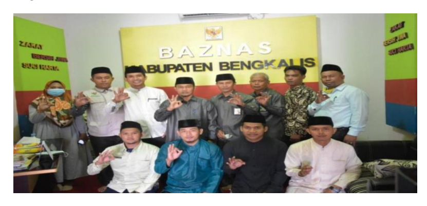
Figure 8. Documentation with coastal preachers by Baznas Bengkalis Regency

This thesis scholarship is intended for mustahik, with the previous selection by Baznas. The field that received the scholarship is the field of da'wah and advocacy, where each sub-district will recruit a preacher, where one sub-district will recruit one person then selected. The chosen one will be placed in the village area -village. The 11 children from Bengkalis Regency who have been elected are placed in villages such as Jangkang Village, Sungai Batang, Mandau, Pinggir, Coastal Pambang, Perapat Tunggal and the new Kembung Village.