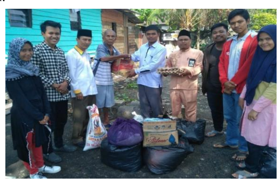
Figure 7. Assistance for fire victims by the Bengkalis Regency Baznas

In the humanitarian field or the Baznas for Disaster Response, the Baznas of Bengkalis Regency will open donations for fire disasters, the seriously ill, and other humanitarian activities. Disaster Response Baznas (BTB) and BAZNAS volunteers will help by spreading donations for victims of floods or national disasters. For example, in the recent surge, BAZNAS Volunteers took to the field by distributing food to people whose houses were flooded.